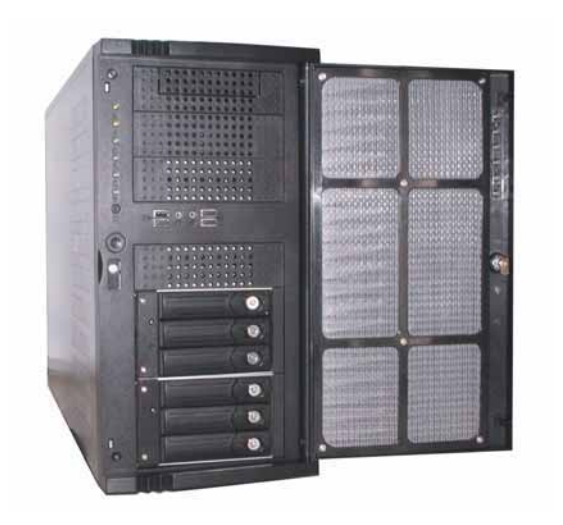
Type A+ SI-0357 x 1