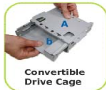
Convertible Drive Cage

Allowing to assembly a standard 5.25" Optical Drive or a 3.5"HDD