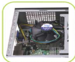
57mm KOZ Illustration

chassis build in Intel DQ45EK with Intel boxed Core 2 Duo Processor (TDP 65W)