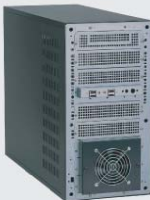
Type B: 5*5.25"+7*3.5"HDD drive bays

HDD frame for 5-devices HDD, with anti-vibration soft mounting kits and 9cm cooling fan