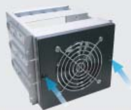
Easy swap fan to HDD cage

HDD frame for 5-devices HDD, with anti-vibration soft mounting kits and 9cm cooling fan