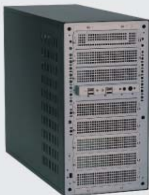
Type A: 8*5.25" drive bays+2xHDD Bracket