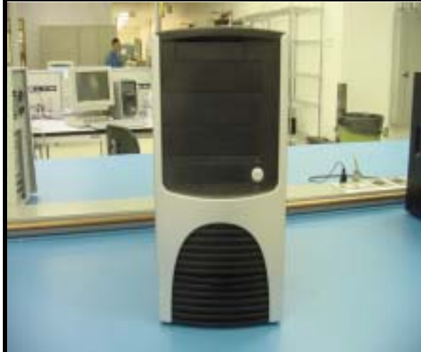
Chassis Front with Cover On