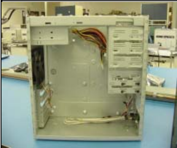
Chassis Side with Cover Off