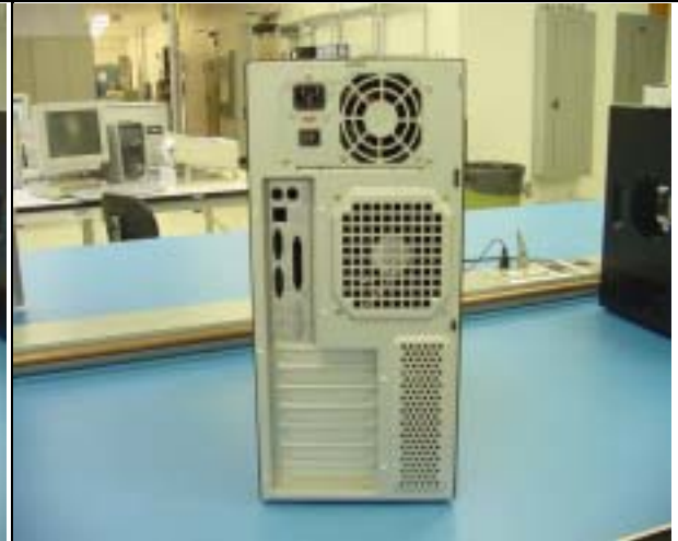
Chassis Rear with Cover On