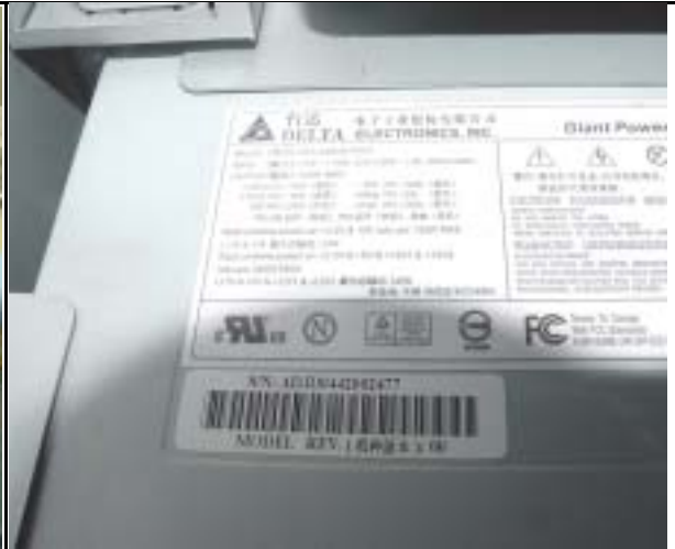
Label (Include Manufacturer's Information Typically Located on the Back of the Chassis)