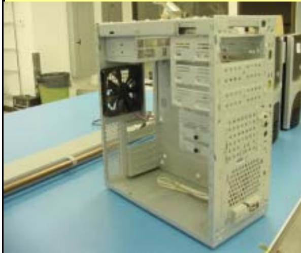
Chassis Isometric - Front with Cover Off