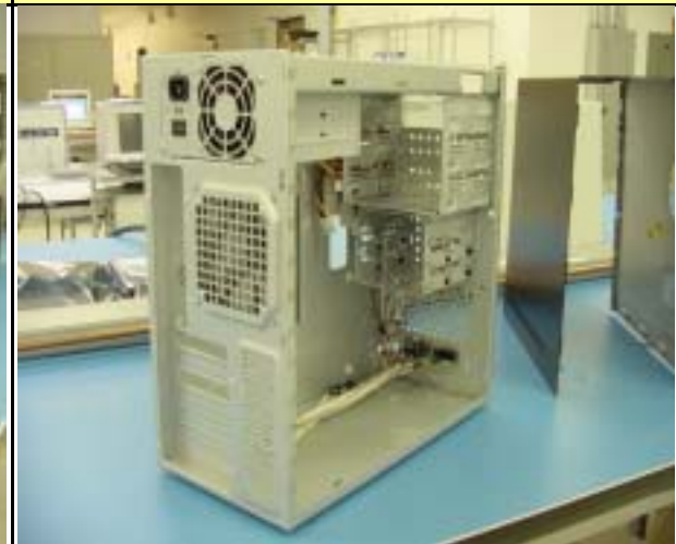
Chassis Isometric - Rear with Cover Off